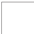
NCS S 0500-N Structural