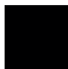
Black nano- laminate