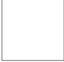
NCS S 0500-N Smooth