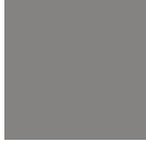
NCS S 6000-N Smooth