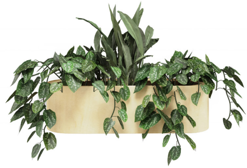
SILVER VINE AND GOLDEN MAIRE